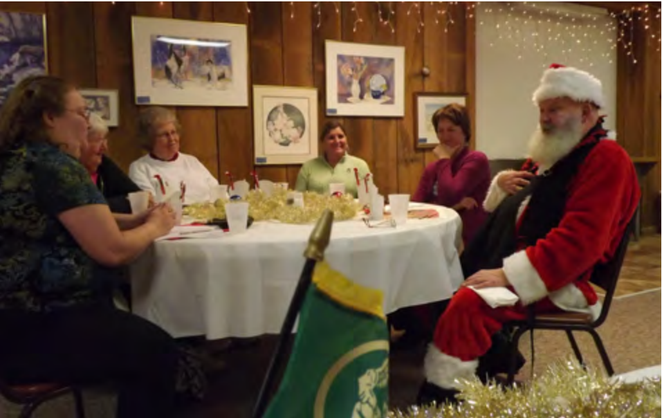
Special guest Santa Claus chats with some of the members at INFBPW/ Knightstown's December meeting.