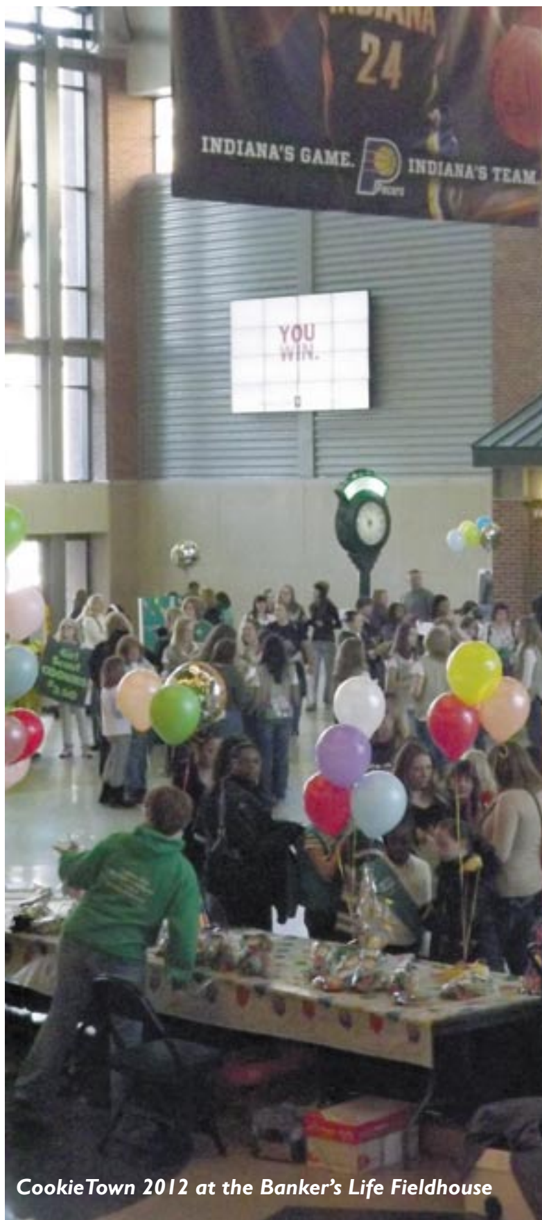
CookieTown 2012 at the Banker's Life Fieldhouse