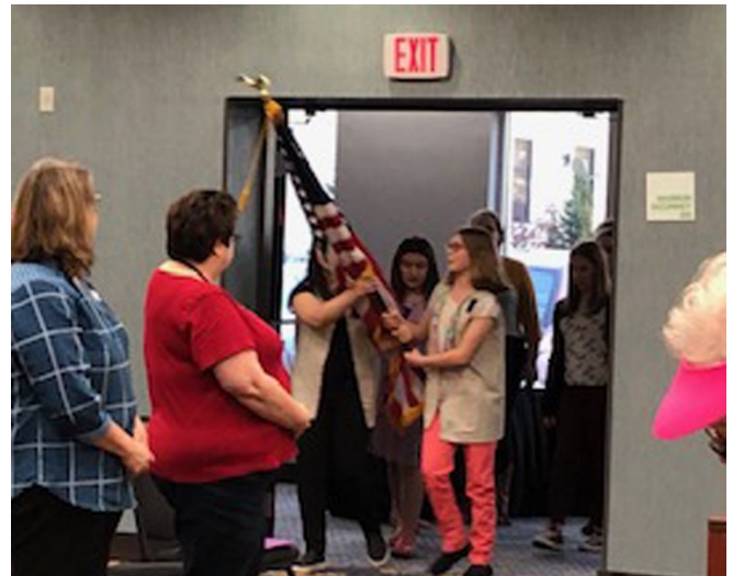
Girl Scouts Presenting the Colors