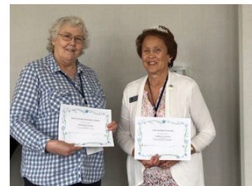
Local Organizations Celebrating Various Awards at Convention