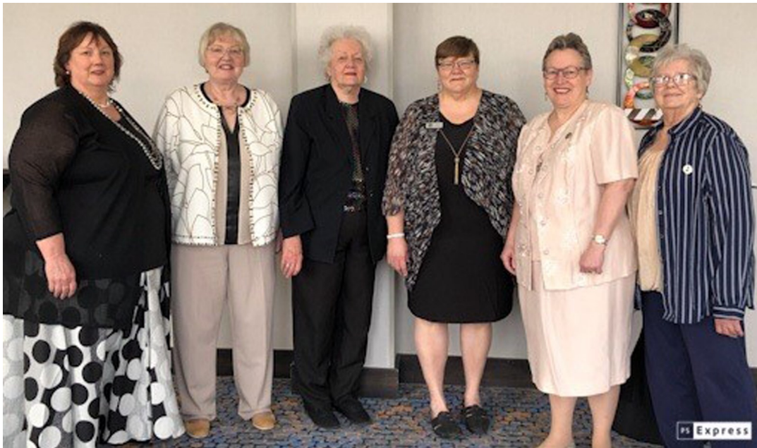
2019-2020 Installed Officers, left to right: