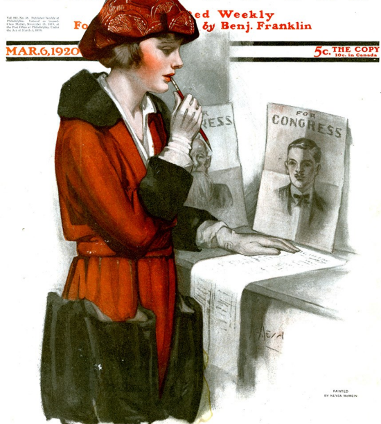
Beginning: The Book of Susan - By Lee Wilson Dodd