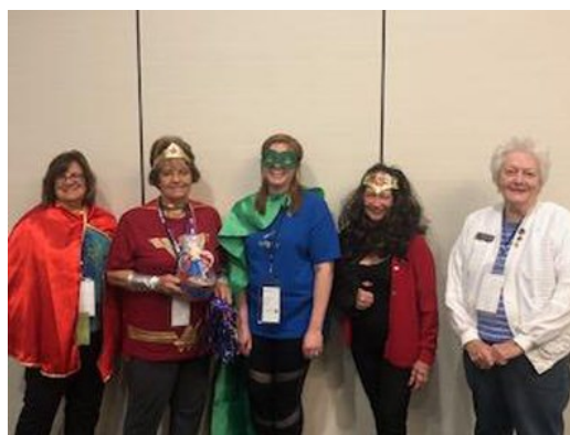
Wonder Woman Contestants